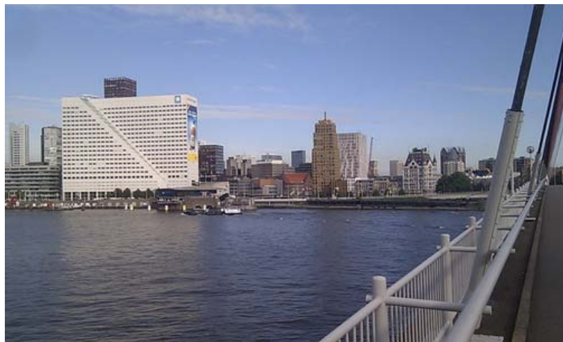
Rotterdam will host over 6000 LGBTQ athletes for the EuroGames 2011